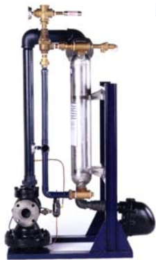
PVI INSTANTANEOUW STEAM WATER HEATER

ISX Instantaneous Water Heater—Indirect fired